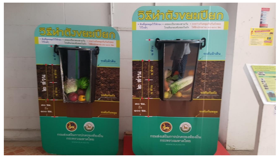
Figure 4-5 : Instructions for composting by the MOI