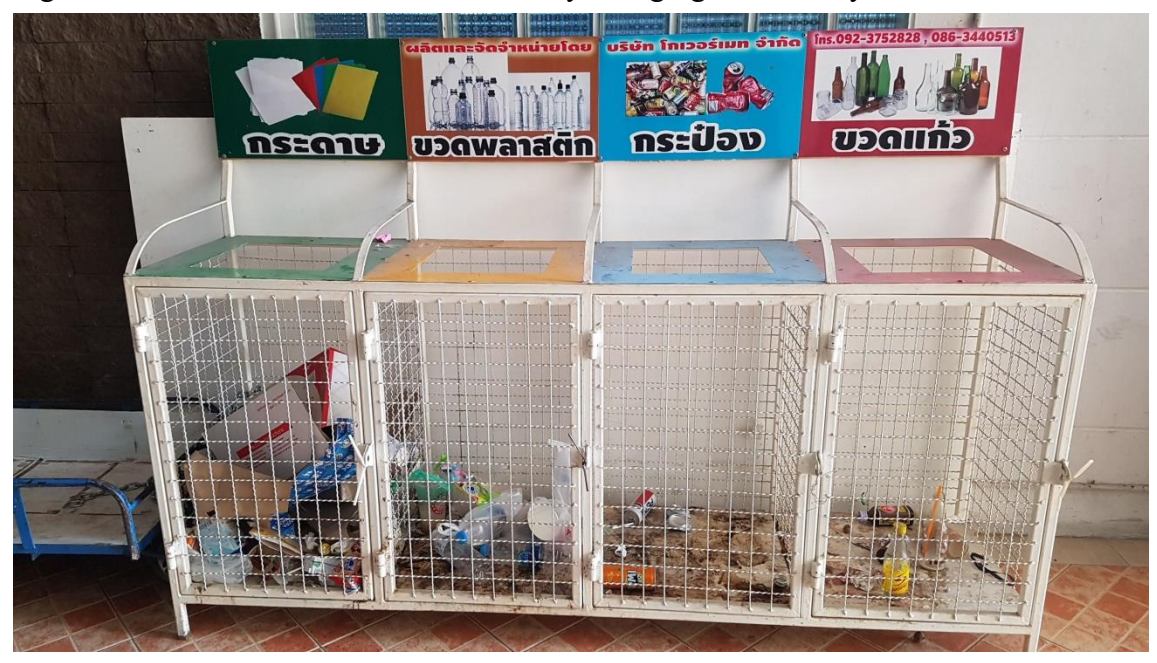
Figure 4-4 :The MOI instructs a correct way to segregate waste by this instruction kit